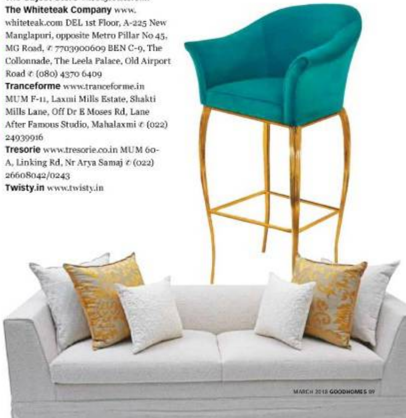
MARCH 2018 GOODHOMES 99