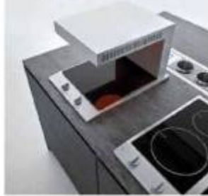
MKM LUXE SUISSE

No matter what you opt for, the appliances should be a reflection of your food habits.