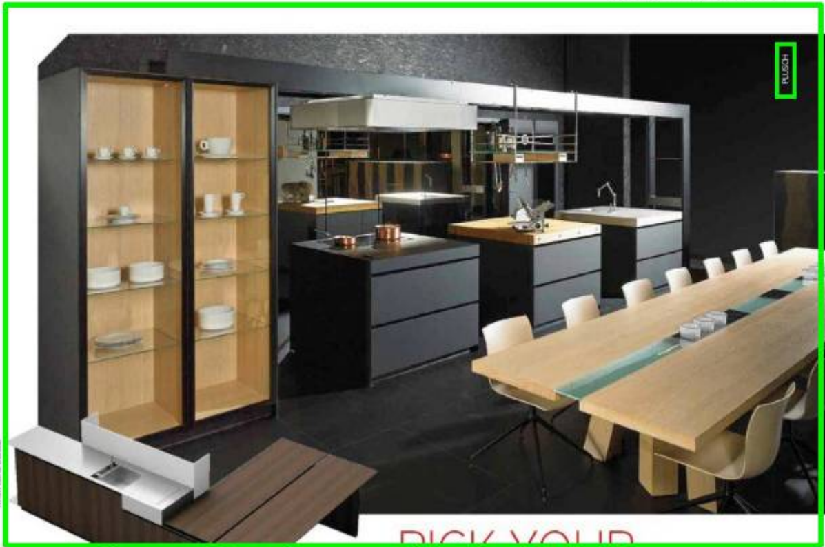
MKM LUXE SUISSE