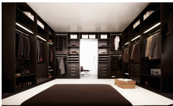
Lighting: Dress in Style

You can completely customize your wardrobe space to fit your needs. You can customize them in our stores to the extent to have watch winders for your expensive watches, spectacle holders, inbuilt- safe systems, customized jewellery inserts in your drawers, customized island dresser with an inbuilt motorized mirror. Choose from a selection of drawers, clothes rods, shelves, and shoe storage to make the most of your closet space. Customizable accessories, such as modular drawer dividers, can help you further organize your walk-in closet.