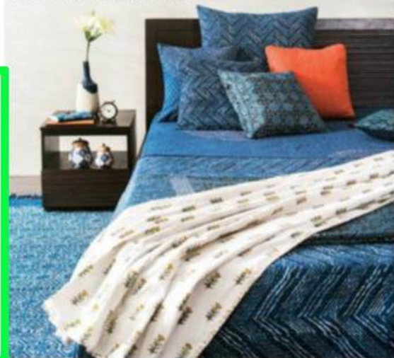
Avoid using rugs in the monsoons especially with wood flooring.