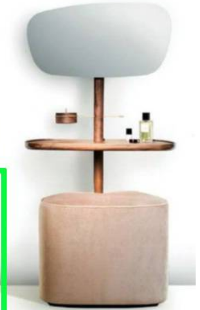
Brass and marble make this piece stand out even in gloomy weather.