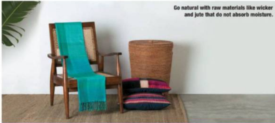
Go natural with raw materials like wicker and jute that do not absorb moisture.