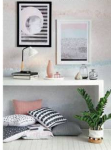
From stripes to polka dots, adopt bold prints of the 80s to brighten up the room.