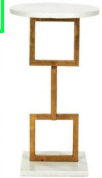
Materials like marble and stainless steel can be used for outdoor furnishings.