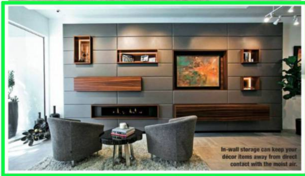
In-wall storage can keep your décor items away from direct contact with the moist air.